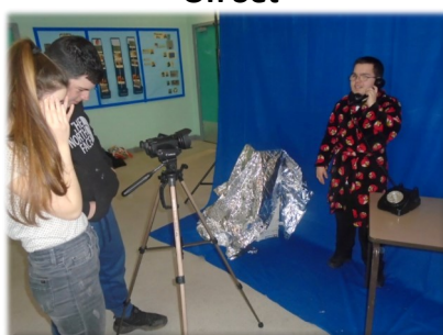
Lee Video Camera